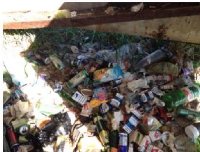
Public toilet in BCP "Kosyno"