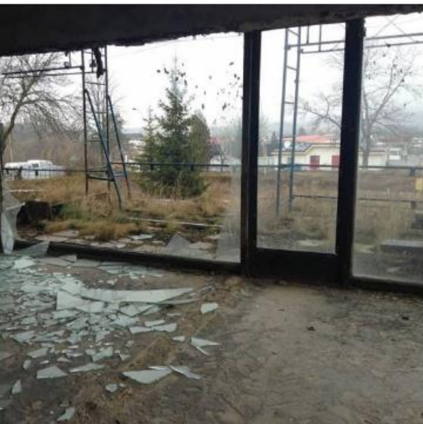
Reconstruction in BCP "Uzhhorod"