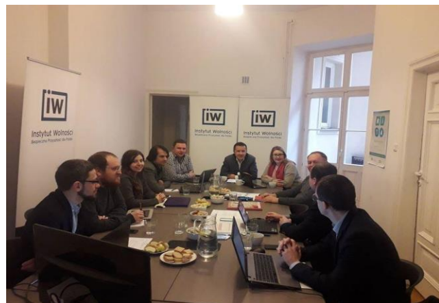
Ukrainian-Polish Expert Meetings in Kyiv and Warsaw, March-May 2019