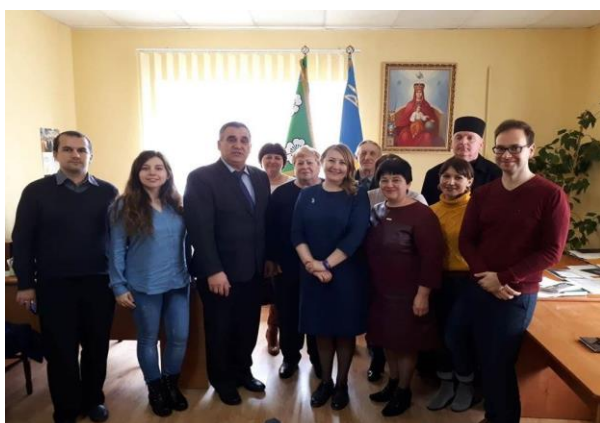
EWB's experts together with the representatives of the Shehyni community

Support: Open Society Foundation, International Renaissance Foundation