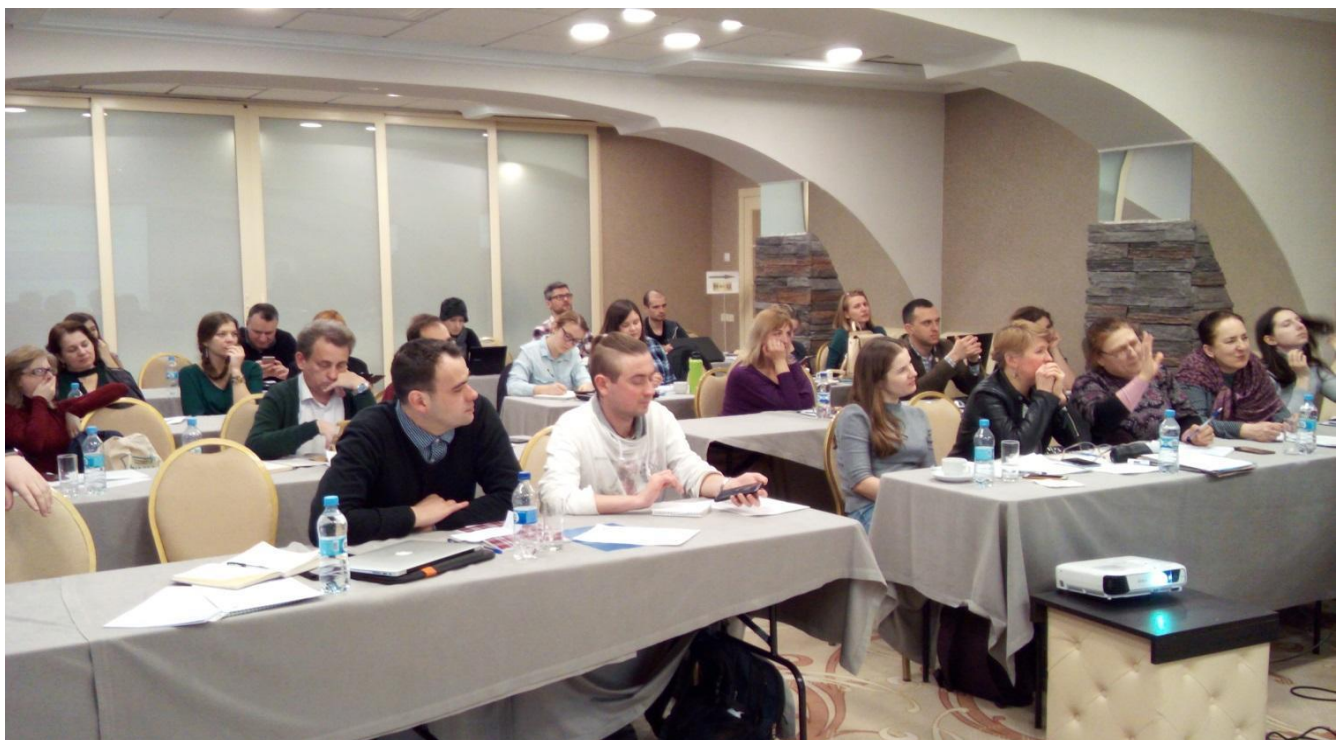
Journalist workshop “How to cover labour migration and avoid fakes”, Kyiv, March 2019