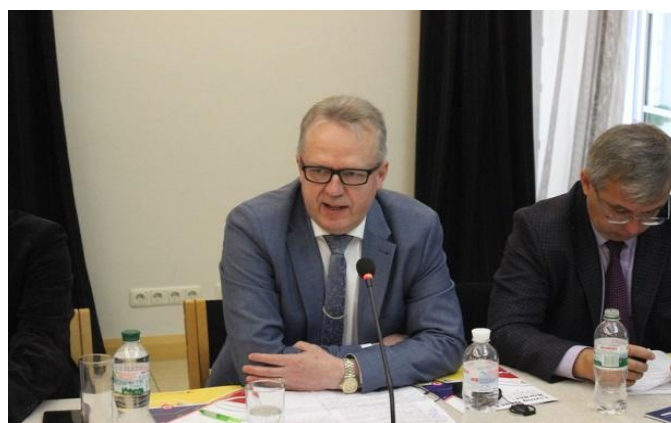
Head of EU Advisory Mission for the Civilian Security Sector Reform in Ukraine during the discussion "European Border: Challenges and opportunities"